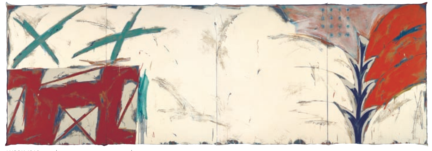
WORK 1316, 2000 Acrylic, cotton cloth on canvas coll. Niigata City Art Museum