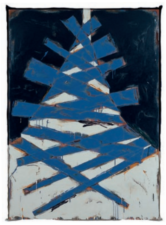
WORK 1666, 2006 Acrylic, cotton cloth on canvas