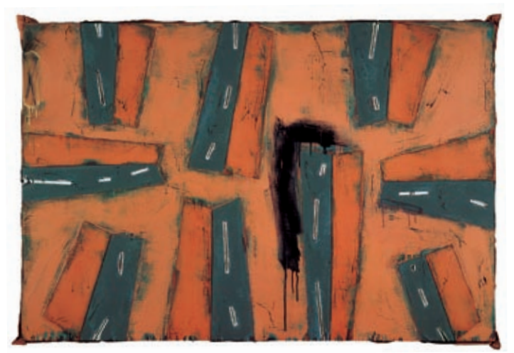
WORK 639, 1991 | Acrylic, cotton cloth, wood on canvas

In the '90s, the surfaces in NODA's picture planes grew flatter, and the multilayered structure and images that were characteristic of his work were created by sewing, folding back, and overlapping the canvas. At the same time, NODA began experimenting with a variety of shapes, color combinations, and textures. The diverse developments that emerged during this period expanded NODA's range, and many of the artist's notable works that are housed in museum collections around the country stem from this period.