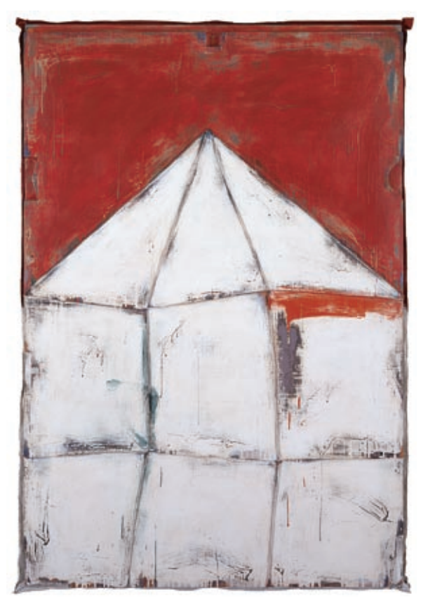
WORK 580, 1990 Acrylic, wood on canvas