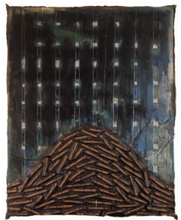
WORK 299, 1987 Acrylic, wood on canvas coll. The Museum of Modern Art, Wakayama