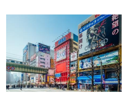
Akihabara, Tokyo's MANGA district.