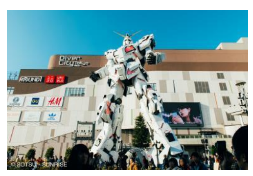
The life-sized Unicorn Gundam Statue in Odaiba. (C) SOTSU, SUNRISE Location: DiverCity Tokyo Plaza