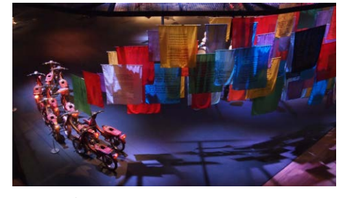
Jompet Kuswidananto Words and Possible Movement 2013 Motorbikes without machine, fabric flags Dimensions variable Collection: Mori Art Museum, Tokyo

With a total population of over 600 million, ASEAN's presence in the international community is expected to only accelerate, also attracting attention from overseas investors as a vast emerging market due to the advent of free trade. Although growth rates vary depending on the country, high economic growth and the developments that accompany it throughout the region are rapidly transforming the urban landscapes and bringing dramatic changes to people's lives. At the same time, there are concerns about resulting social disparities and the loss of traditional cultures. As artists frequently look at such changes with a critical eye, this section closes in on the driving forces and issues generated by growth and development.