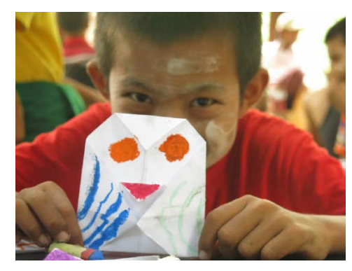
New Zero / Aye Ko Village Art School 2015-

Southeast Asia is home to a diverse mix of ethnic groups, languages, cultures, and religions that coexist side by side. Even in this age of rapid growth and development, annual events/functions and religious rituals passed down over the generations continue to be an important part of Southeast Asia's daily life, directly linked to their interests in not only the world of the living but also the afterworld and the supernatural. This section presents artists who frequently use traditional artistic techniques and concepts, ranging from ancient nature worship to specific religions, to create artworks depicting the broader worlds of mysticism and spirituality.