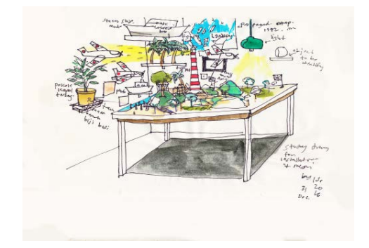
Study drawing for anOther story 2017

Among the new generations of artists in Southeast Asia, there are those who are trying to revisit the region's repetitious histories of political, economic, and social change – particularly its histories of war and repression – and to integrate its memories as one's own. At the same time, there are also those who seek to pass on the legacies and contributions to contemporary art by artists of past generations to the present. This section of the exhibition showcases artworks that revisit the past and engage in cross-generational dialogues in an attempt to situate contemporary society and art within a much larger narrative of history.