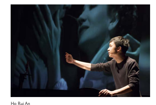
Ho Kui An Solar: A Meltdown (still) 2014-Video, digital print, solar-powered toy 60 min.

Yee I-Lann Fluid World (from the series "Orang Besar") 2010 Direct digital Mimaki inkjet print, acid dye, batik crackle |apanese indigo dye, 100% silk twill 140.5 x 298 cm