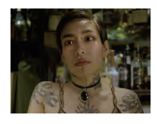
Chikako Yamashiro Chinbin Western: Representation of the Family 2019 4KHD Video, color, sound Collection of the artist