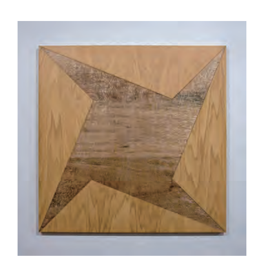
Yasuko Toyoshima Square Margin Throwing Star 2018 Plywood, linseed oil, oil paint 91.0×91.0×2.7cm Collection of the artist