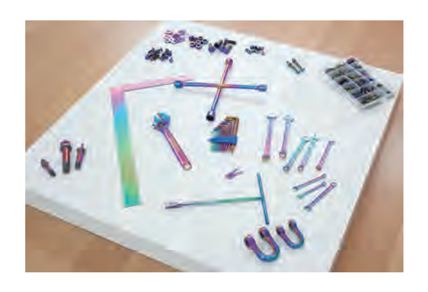
Yuichiro Tamura Midnight Rainbow 2017 Dimensions variable Collection of Yuka Tsuruno Gallery © Yuichiro Tamura Courtesy of Yuka Tsuruno Gallery