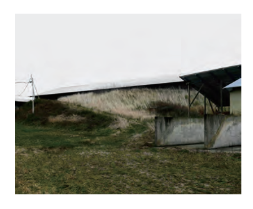
01 Keizo Kitajima IITATE (From the series UNTITLED RECORDS) 2011/2019 Pigment print 83.0×103.7cm Collection of the artist