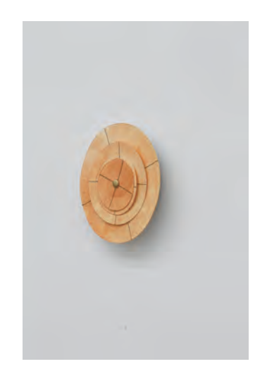
09 Yasuko Toyoshima Discrepancy 2018 Paper, split pin, acrylic paint, ballpoint pen φ11.5 cm Collection of the artist