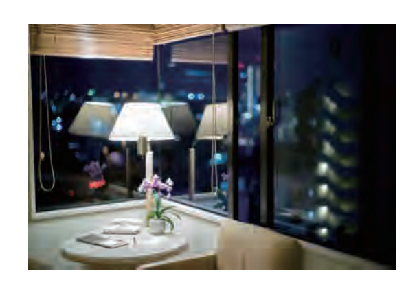
Futoshi Miyagi From the Palace on the Hill #2 (From In a Well-lit Room: Dialogues Between Two Characters) 2019 Digital C-print Collection of the artist © Futoshi Miyagi