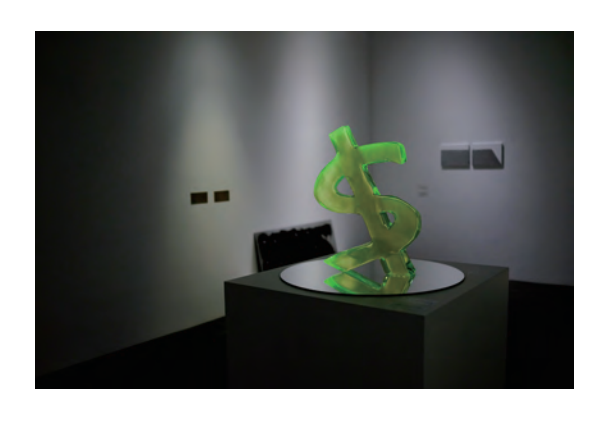
04 Erika Kobayashi Dollar 2017 Uranium glass, mirror, ultraviolet lamp 61.0×41.0×7.5 φ70 cm Private collection Cooperation: Fairywood Glass Museum © Erika Kobayashi Courtesy of Yutaka Kikutake Gallery