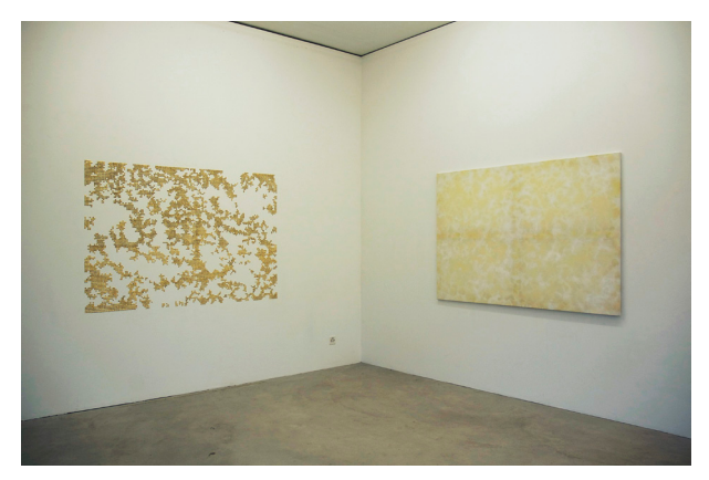
AZUMATEI Jun Right: Sad but True , 2011 Left: Sad but True , 2011 © Jun Azumatei / courtesy of AB Gallery