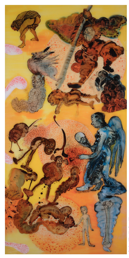
Nalini MALANI Splitting the Other (Panel no.14 of fourteen panel painting environment) 2007