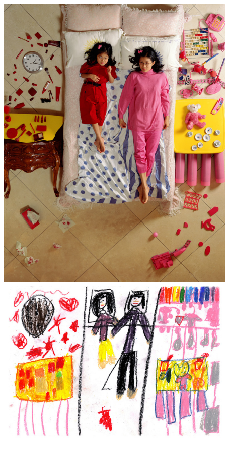
Yeondoo JUNG Wonderland – 'Afternoon Nap' 2004 © Yeondoo Jung