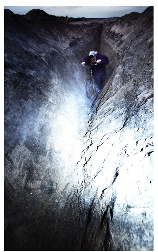
SHIGA Lieko, RASENKAIGAN , 2010 © Lieko Shiga