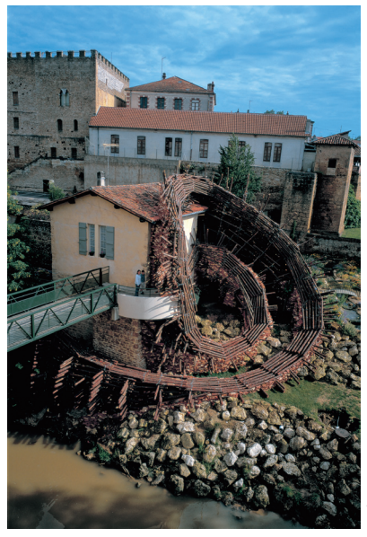
KUNIYASU Takamasa Spiral of MIDOU , 1997 Photo by Takamasa Kuniyasu