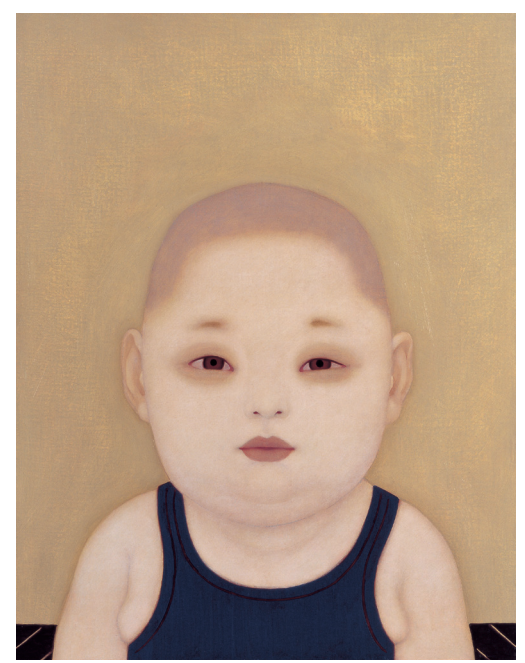
NAKAZAWA Hideaki, Face of a Child – Buddist Priest, 2006

The photography of Shiga Lieko, who drew widespread attention with her 2007 photo book Canary , possesses a stunning power that upends the viewer's expectations. For Shiga, taking photographs is a ritualistic act that lays bare the very roots of human existence, riddled with contradictions and conflict between the body, fated for death, and the mind that longs for life. In producing images, she thoroughly researches the locations for her photographs and seems to make them one with her own flesh and blood. In the process of distorting and destroying images and then weaving them back together again, she poses fundamental questions about the meaning of human life. Shiga studied in London and has worked in numerous locations worldwide. Since 2009, she has lived in the Kitakama district of Natori, Miyagi Prefecture, which suffered damage in the Great East Japan Earthquake of March 2011. Her photos in this exhibition, the first new work she has shown in four years, were shot in the city.