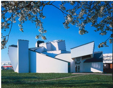
Vitra Design Museum, Frank Gehry, 1989

Since 1996, the Vitra Design Museum has organized the international muscon conference in cooperation with annually changing local hosts. The aim of this conference is to promote the international exchange of travelling exhibitions and other collaborative initiatives among museum professionals and decision makers. Outside of Europe muscon is also regularly held in the United States and Asia-Pacific. The muscon network has brought together several hundred institutions and contributed significantly to further a productive exchange of travelling exhibitions in the international museum landscape.