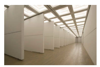
Gallery for Artist Associations

Number of visitors per year 2007 1.317.508 2010 1.266.989 2013 1.205.249 2008 2011 1.253.764 2014 1.193.917 1.309.747 2009 1.246.840 2012 1.259.966 2015 1.194.428