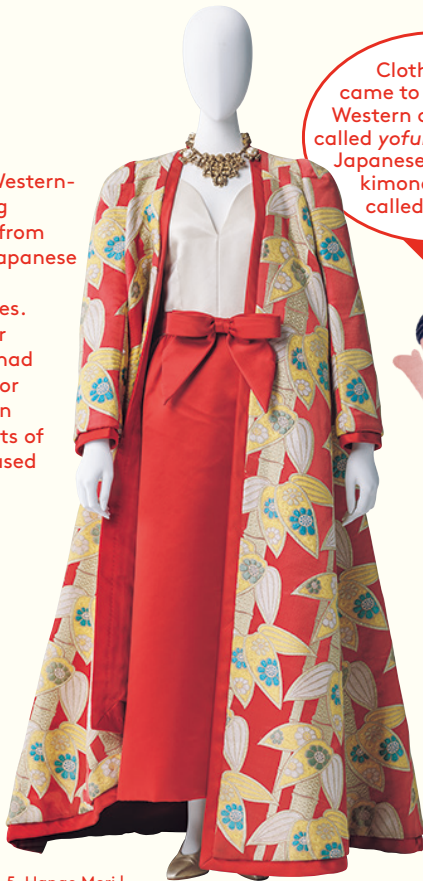
5. Hanae Mori | Evening ensemble (coat, dress) | HANA E MORI | 1968 | Iwami Art Museum

Clothes that came to Japan from Western countries are called yofuku . Traditional Japanese clothes like kimono are also called wafuku .