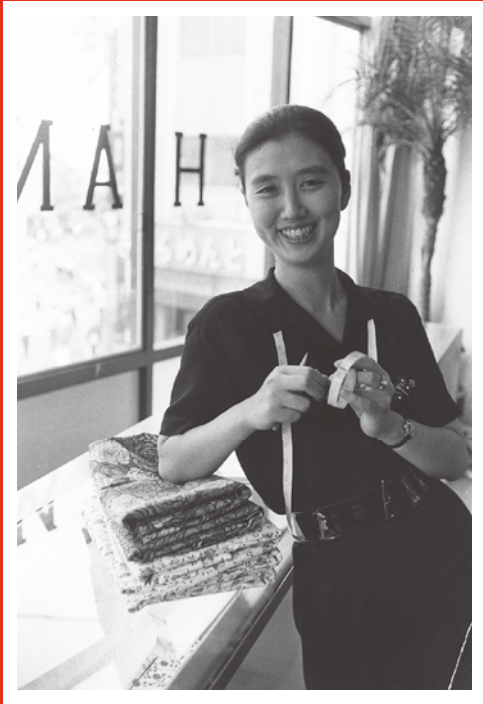
2. Mori at her first shop, "Hiyoshiya," around the time that it opened | mid-1950s

Hanae Mori was a fashion designer, born in 1926, who created clothes that people everywhere admired. Her name became known all over the world. In this exhibition, you will see many of the works she made, including dresses decorated with butterflies, and learn about her life.