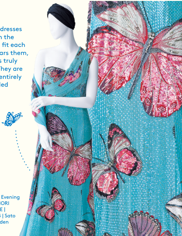
14. Hanae Mori | Evening dress | HANAЕ MORI HAUTE COUTURE | Fall-Winter 2004 | Sato Shinobu Art Garden Co.,Ltd.

Haute couture dresses are the finest in the world, made to fit each person who wears them, and each one is truly one of a kind. They are custom-made entirely by hand by skilled artisans.