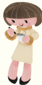
4. Hanae Mori | Day dress (costume for the film Lone Hawk of the Water Front ) | HANAË MORI | 1967 | Iwami Art Museum

Back then, most homes did not yet have televisions, so going to the cinema was one of people's favorite things to do.