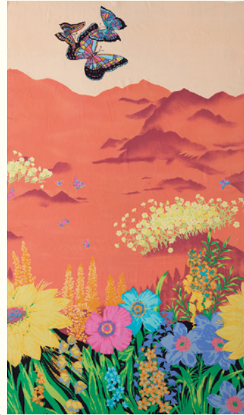
7. Ukon Textile Design House | Textile “Dream of a Butterfly” | Shiki Fabric House | c. 1973 | Hanae Mori Office

This dress features butterflies, which Mori was famous for using in her designs.