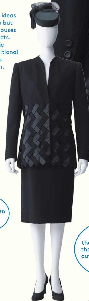
15. Hanae Mori | Cocktail suit (jacket, skirt) “Black silk-satin and wool cocktail suit” | HANAЕ MORI HAUTE COUTURE | Fall-Winter 1989 | Iwami Art Museum

Mori found design ideas not only in kimono but also in Japanese houses and everyday objects. In this outfit, fabric braided like a traditional Japanese basket is used as decoration.