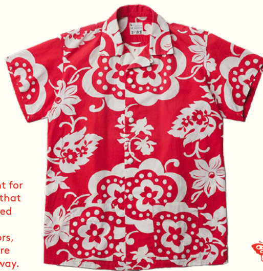
3. Hanae Mori | Red floral aloha shirt for men (costume for the film Crazed Fruit ) | 1956 | Iwami Art Museum

Mori had a talent for making clothes that perfectly matched the feel of each film and its actors, so more and more work came her way. She is said to have designed costumes for hundreds of films!